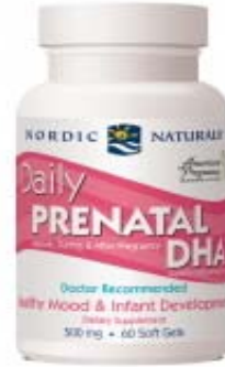
Vitamin/Health: Nordic Naturals Prenatal DHA $29.99 for 90 softgels