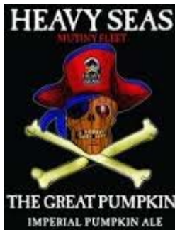
Wine/Beer: Heavy Seas The Great Pumpkin Ale $7.99 for 22 oz