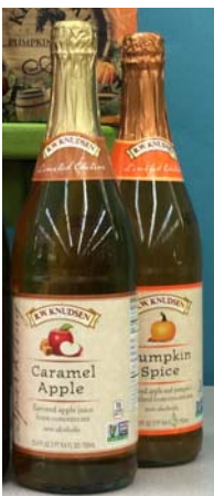
Holiday/Seasonal: Knudsen's Sparkling Juice in Caramel Apple or Pumpkin Spice $4.39