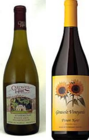
Wine/Beer: Cardwell Hill Pinot Gris $16.99