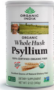
Vitamin/Health: Organic India Whole Husk Psyllium $16.99