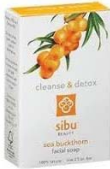
Personal Care: Sibu Sea Buckthorn Bar Soap $6.99