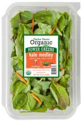
Produce: Taylor Farms Organic Kale Medley $3.49 for 5 oz