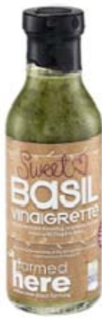
Produce: Farmed Here Sweet Basil Vinaigrette $7.49