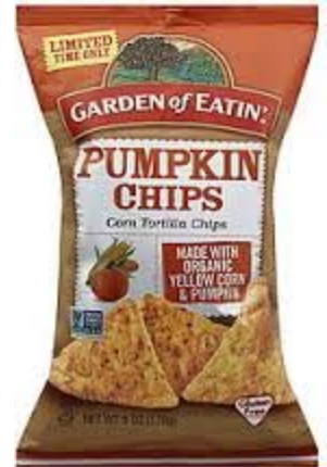
Holiday/Seasonal: Garden of Eatin' Pumpkin Chips $3.49 for 6 oz