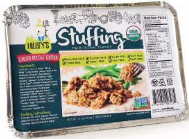
Frozen: Hilary's Holiday Stuffing (WF, GF, Vegan, Nut free) $6.99, Co+op Deal