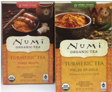
Grocery, Packaged: Numi Turmeric Tea in Three Roots or Fields of Gold $6.99