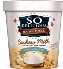
Frozen: So Delicious Dairy Free Cashew Milk Ice Cream in Creamy Cashew $5.99, 16 oz