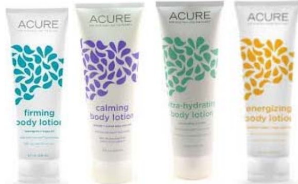
Personal Care: Acure Lotion in Energizing Mandarin, Fragrance Free, Calming Lavender Echinacea, Lemongrass Argan $9.99