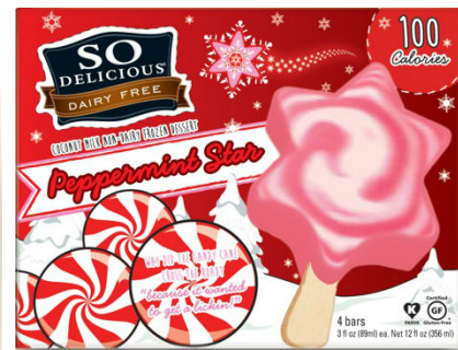
Holiday/Seasonal: So Delicious Coconut Milk Frozen Bars in Peppermint Stick or Snowman $4.99, 4 count