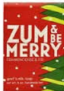
Personal Care: Zum Be Merry Line Bar for $5.69, Lotion $14.99, Mini Bar $2.69, Mini Mist $5.99