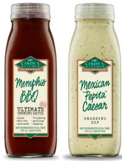
Produce: Cindy's Kitchen Dressing in Mexican Pepita or Memphis BBQ $6.99