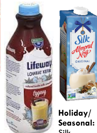
Holiday/Seasonal: Lifeway Lowfat Kefir in Eggnog $3.99