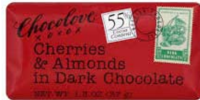
Pop/Candy: Chocolove Mini Bar in Raspberry Dark or Cherry Almond Dark $1.39 for 1.3 oz