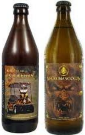
Wine/Beer: B Nektar Meadery in Kill all the Golfers Mead or Necromangocon Mead $8.69 for 16.9 oz