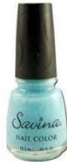
Personal Care: Earthly Delights Nail Polish in Blue Ice $4.39