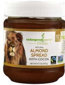
Grocery, Pkg: Endangered Species Chocolate Almond Spread with Cocoa $7.99