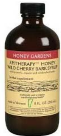
Vitamin/Health: Honeybee Gardens Wild Cherry Bark Cough Syrup $19.99 for 8 oz