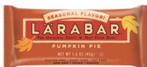
Holiday/Seasonal: Larabar in Pumpkin Pie or Gingerbread $1.69