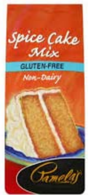
Holiday/Seasonal: Pamela's Gluten Free Baking Mixes in Pumpkin Bread $7.99 or Spice Cake $5.99