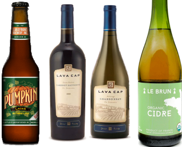
Wine/Beer: Lakefront Brewery Pumpkin Lager $1.99 for 12 oz