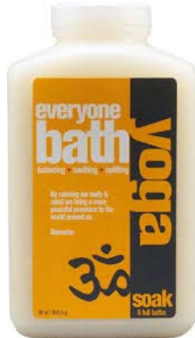
Personal Care: EO Everyone Bath Soak Yoga $12.99 for 30 oz